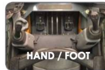
HAND / FOOT