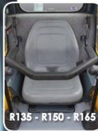
R135 - R150 - R165

Wide opening in the front of the machine and large screen windows provide high visibility for increased safety and precise placement.