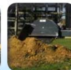
ROTARY BRUSH MOWER